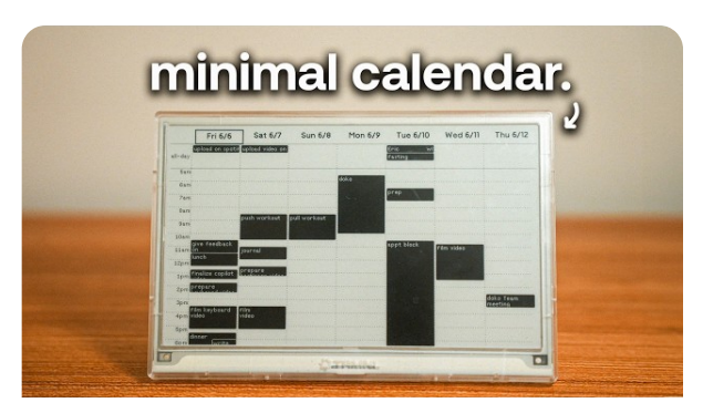
7 tools that quietly improved my life

Check out in-depth video coverage by our team and others.