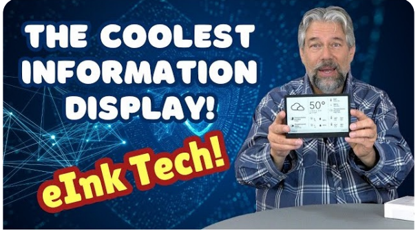
The Fantastic TRMNL eInk Information Display Device