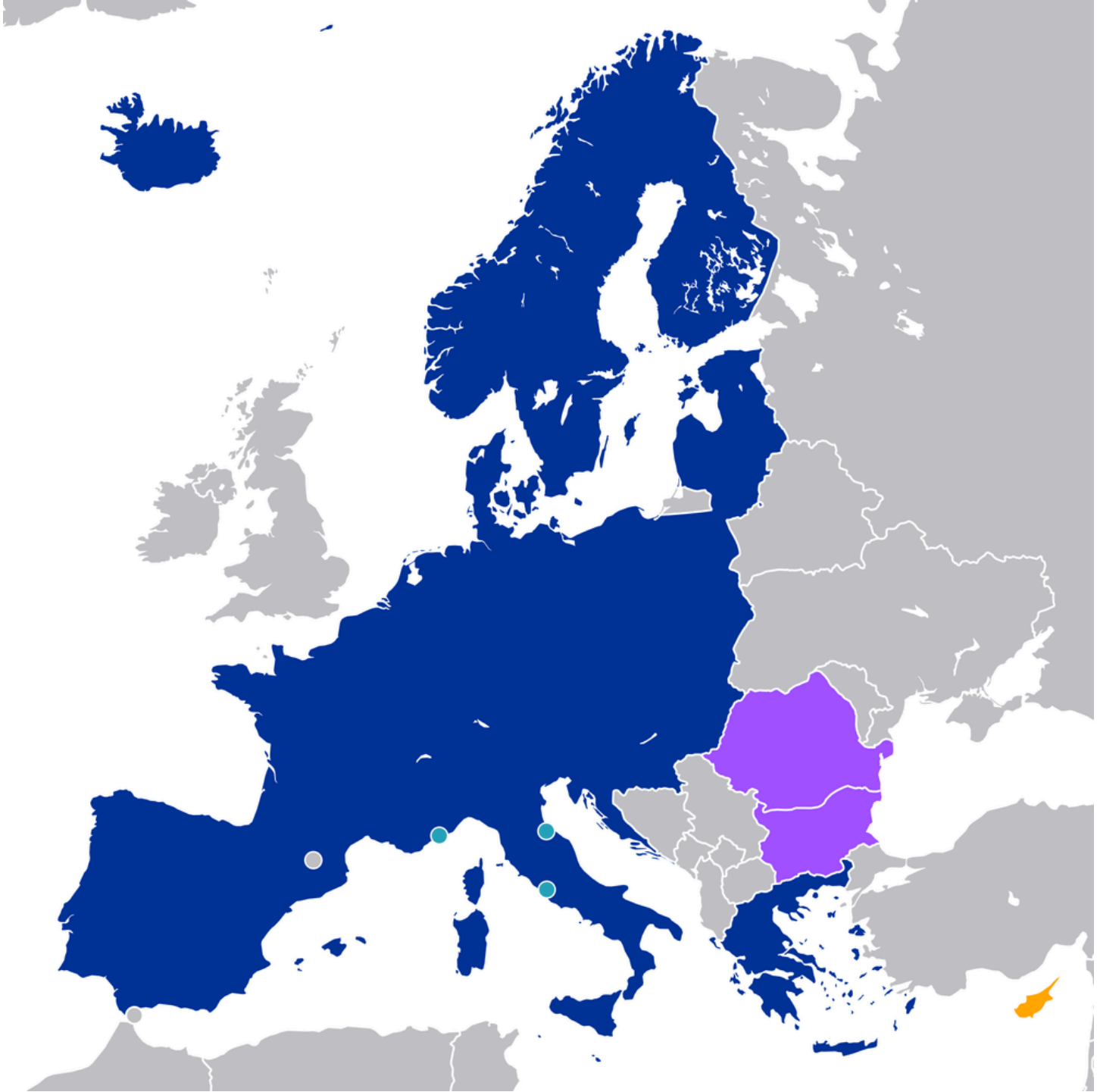
Map of the Schengen Area, covering 29 countries throughout Europe.

My wife and I were on the train back from a one-week bike trip in Germany and Czechia, and were crossing back into Denmark. As the train pulled into Padborg, multiple border officers boarded the train, systematically checking IDs - passports, residence cards, and so on.