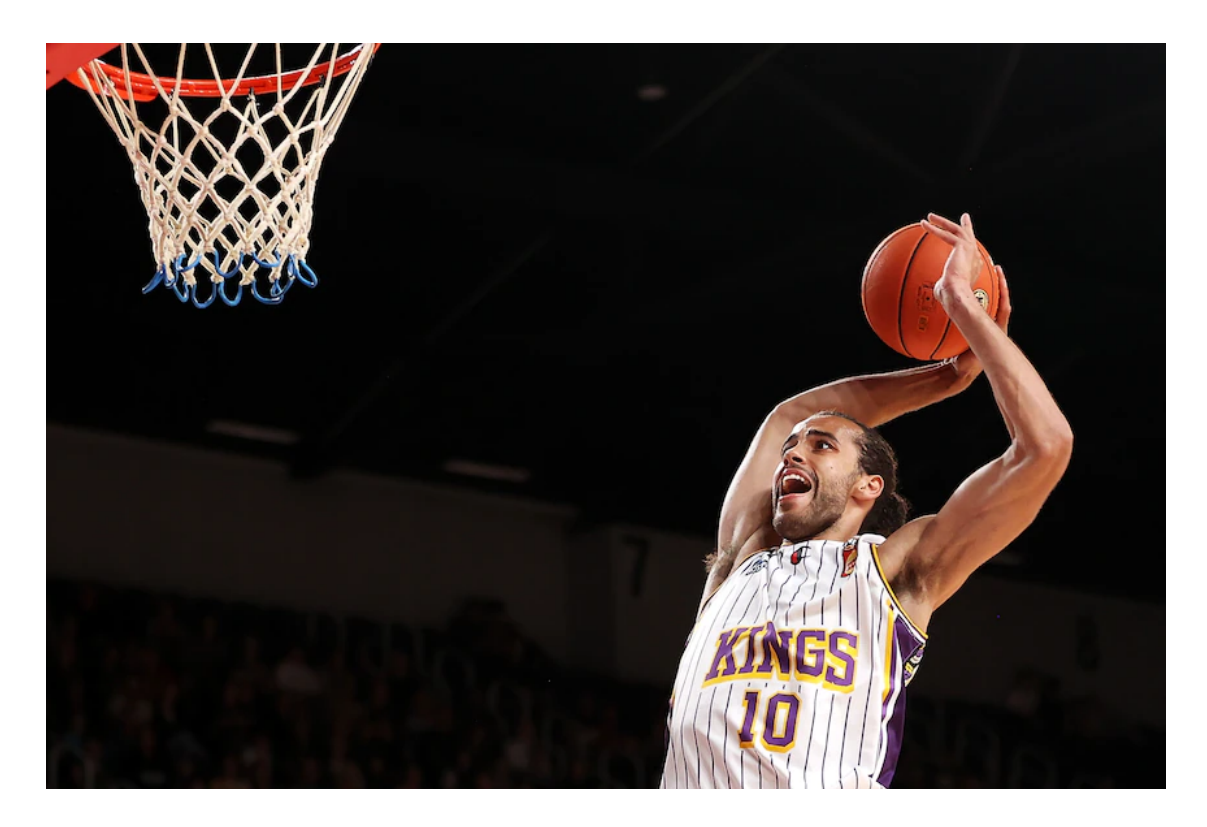
The Sydney Kings are getting ready to slam some sport into our Christmas Day schedule.

The NBL touted the match as "the last scheduling frontier in sport in Australia" when it was announced back in July and, from a modern perspective, that's true.