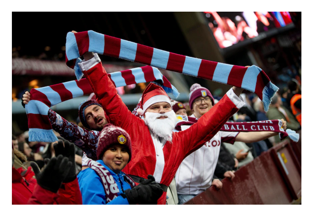
Aston Villa played the first Christmas Day match in the Football League in 1889.

Playing matches on one of the few public holidays in the year actually makes sense — especially in the era before television — and the crowds were regularly very healthy.