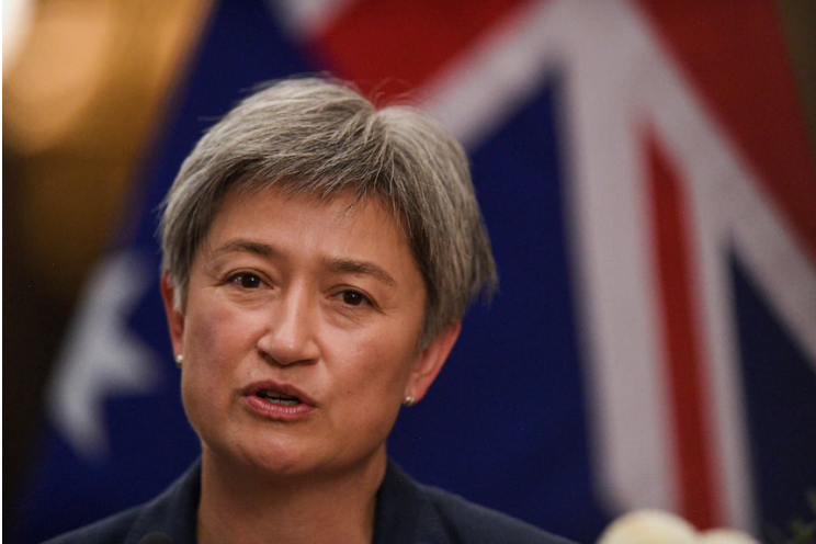
Penny Wong was instrumental in setting the groundwork for Albanese's meeting with Xi this week.

Similarly, she has spent a lot of time in South-East Asia, and on boosting the "centrality" of ASEAN, an institution which some argue is not a particularly robust one.