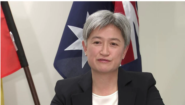
Foreign Minister Penny Wong speaks of bringing Sean Turnell home

Turnell's freedom has been a major priority for the foreign minister. She resisted pressure for more sanctions on Myanmar to achieve it, and pursued the issue as she travelled around the region.