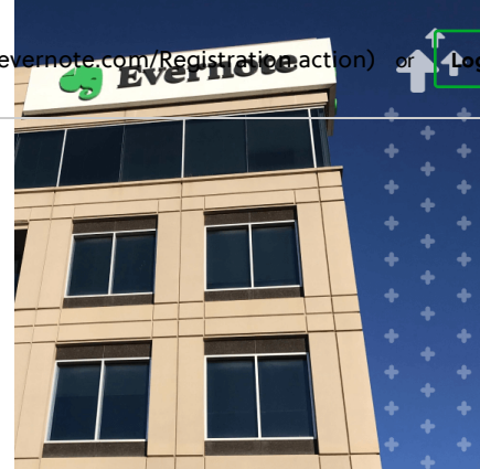
( https://evernote.com/blog/adapting-offices-for-changing-workforce/ ) EVERNOTE NEWS

Tasks in Evernote is now even better at helping you stay organized and on-track, thanks to the addition of one of your most requested features.