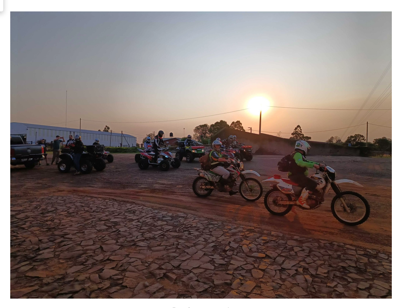
Ready... set... go!

expect to see lots of wild animals around those noisy ATVs.