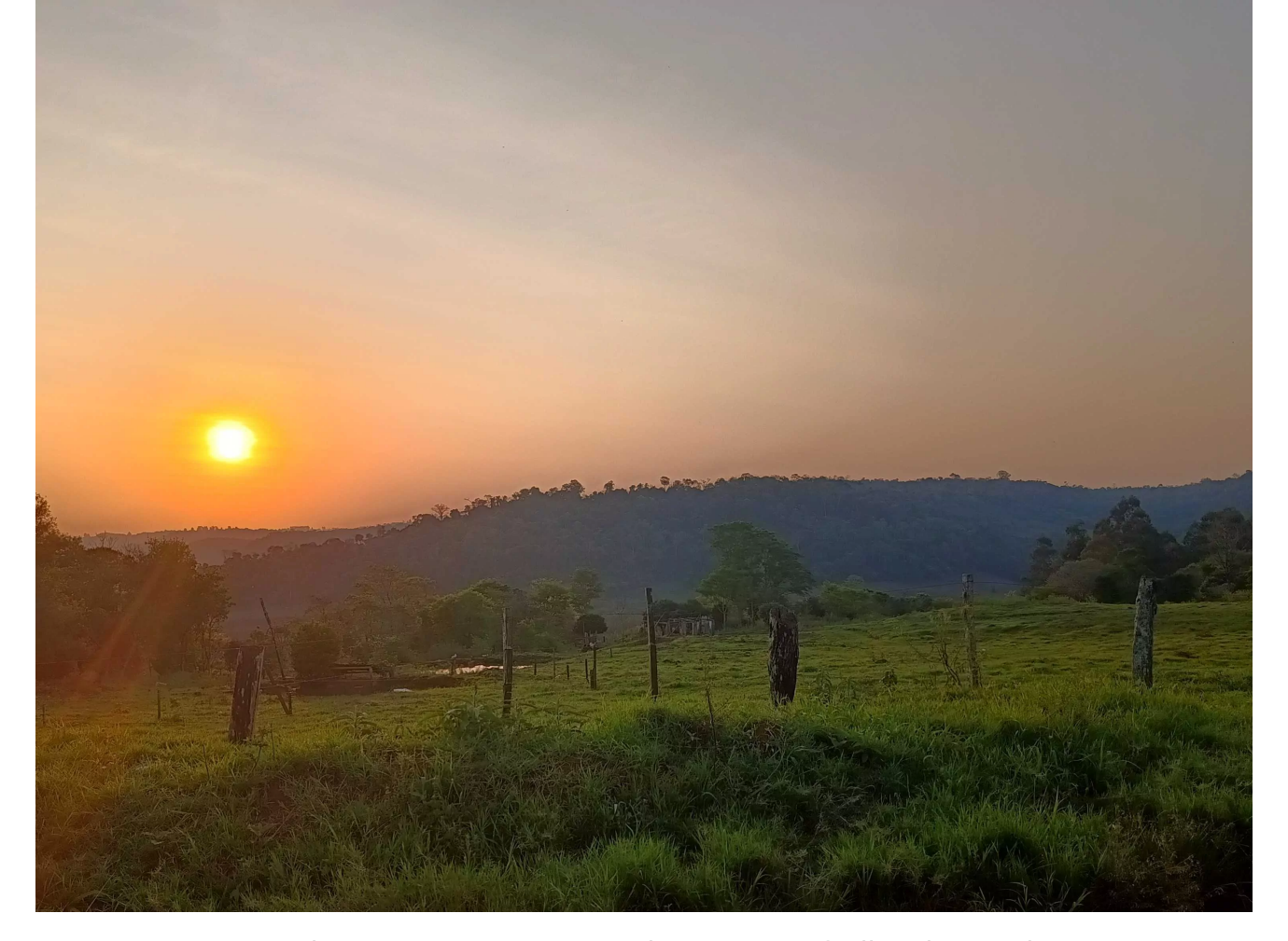
Any time is a good time to enjoy a nice sunset - but more specifically right after the afternoon.

Using neural networks to predict protein functions