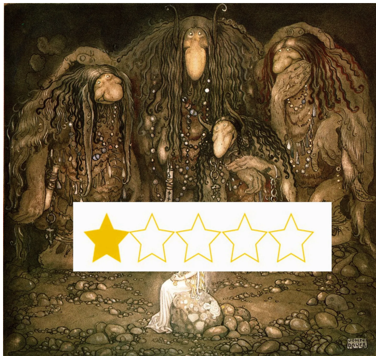
Original troll art by John Bauer (1915)

When I was getting my start as a writer, there was a mildly infamous Amazon troll who left one-star reviews on every book in the indie lit scene. (“Indie” then meant published on small literary presses not self-published on Amazon.) Seemingly a failed writer, he took his frustrations out on authors he’d never met or even read. His “reviews” didn’t even pretend to review the books. Most were poorly written poetry akin to “night sky / smeared with poo poo / mosquito my pee hole? / words r dumb.”