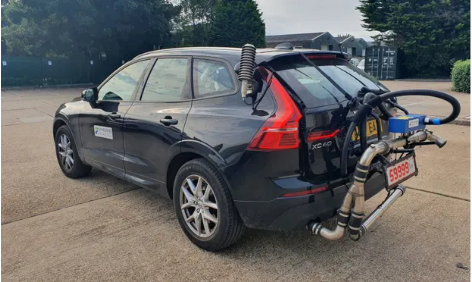
📷 A Volvo hybrid car undergoes emissions tests for the campaign group Transport & Environment in 2021.

But let's zoom out even further and consider the whole life cycle of an automobile. The biggest problem we need to address in society's relationship with the car is the "fast fashion" sales culture that has been the commercial template of the car industry for decades. Currently, on average we keep our new cars for only three years before selling them on, driven mainly by the ubiquitous three-year leasing model. This seems an outrageously profligate use of the world's natural resources when you consider what great condition a three-year-old car is in. When I was a child, any car that was five years old was a bucket of rust and halfway through the gate of the scrapyard. Not any longer. You can now make a car for £15,000 that, with tender loving care, will last for 30 years. It's sobering to think that if the first owners of new cars just kept them for five years, on average, instead of the current three, then car production and the CO 2 emissions associated with it, would be vastly reduced. Yet we'd be enjoying the same mobility, just driving slightly older cars.