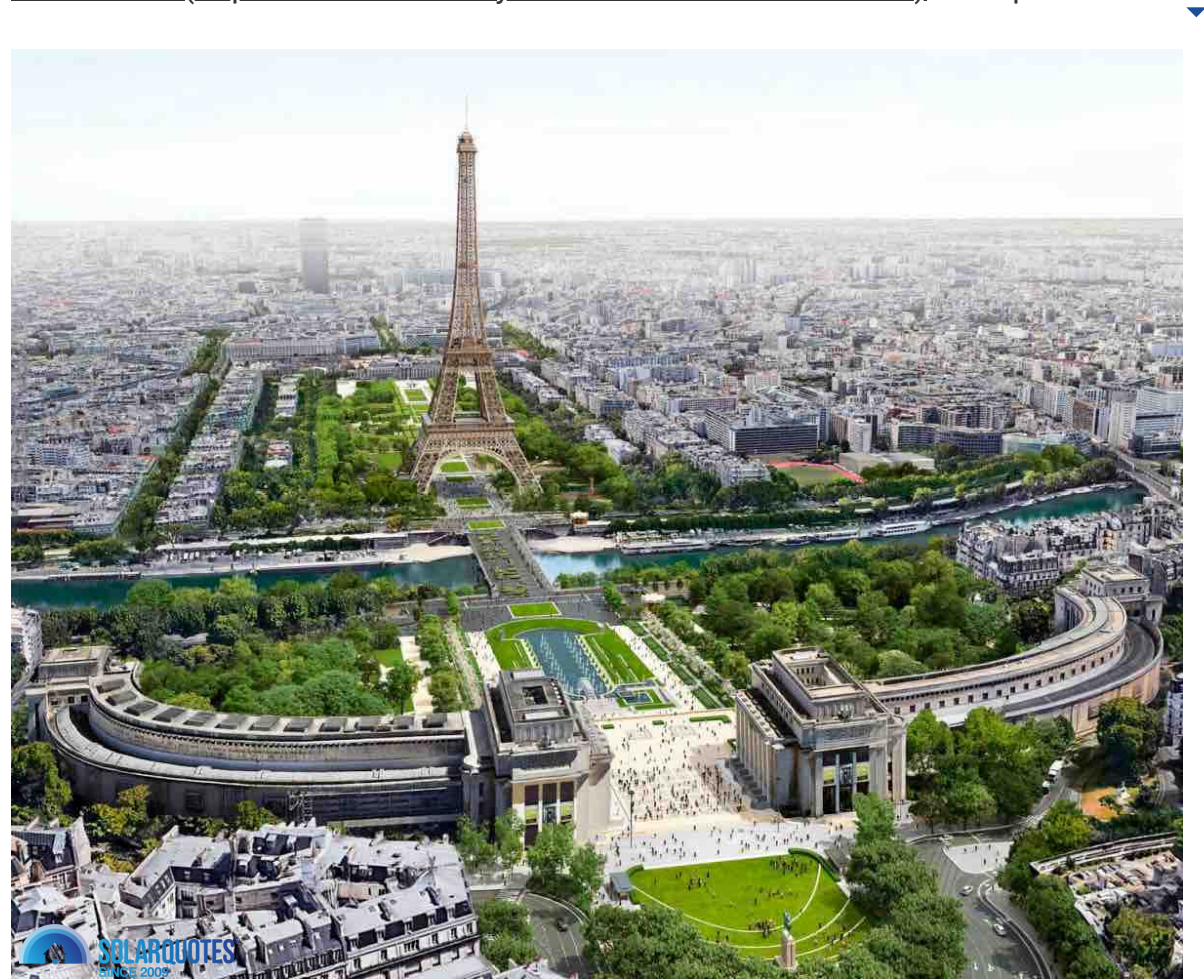
The planned redesign of the Eiffel tower park. Image by Gustafson, Porter and Bowman

Claire Stam (https://reneweconomy.com.au/author/claire-stam/) 6 April 2023